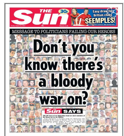
This powerful front page from 2006, featuring the faces of 327 dead British soldiers, screamed at PM Gordon Brown and his Government to wake up to the reality of the savage war in Afghanistan. The Sun has always proudly championed our Forces and fought their corner.

Students will begin to study and apply more complex media theories while maintaining their analytical skills and extended writing. In year 13 students will undertake a close study of the television industry and set texts from this, the close study will continue with Magazines, which will include both historical and contemporary and Online and participatory media. Year 13 will allow students to draw their own conclusions and justifications, while supporting these viewpoints with clear and well thought out evidence from the media texts studied. The year will conclude with two examinations which will test all areas of study.